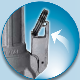
Autolok™ arm locked

Autolok's™ patented locking mechanism, built into the coupling arms, means you simply snap the locking arms shut with one smooth motion and the coupler stays secure and shut until you unlock it. No clips, pins or buttons.