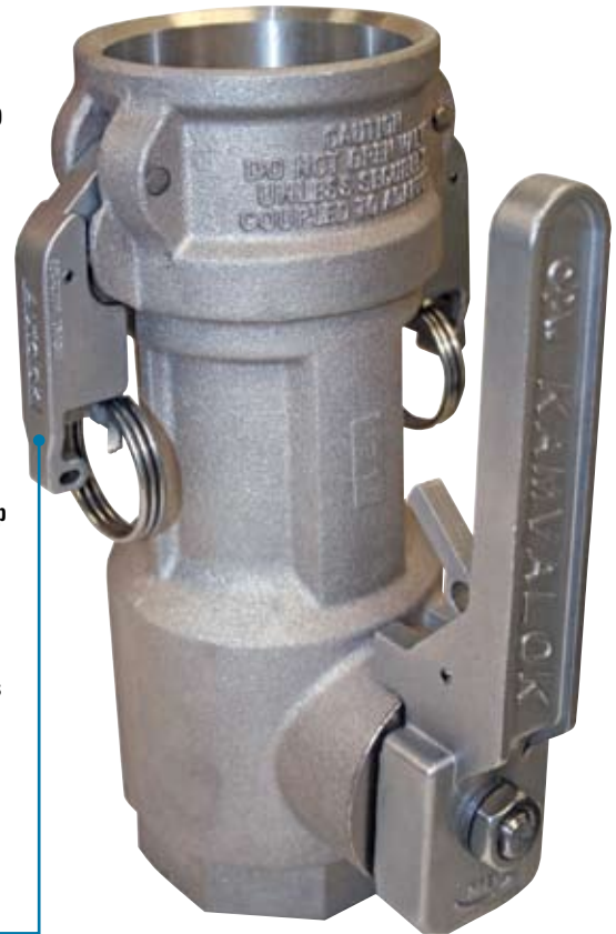
1700DL KAMVALOK® DRY DISCONNECT COUPLING