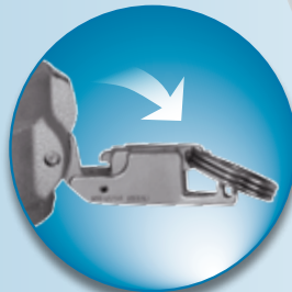
Autolok™ arm unlocked

*Chemraz is a registered trademark of Greene-Tweed